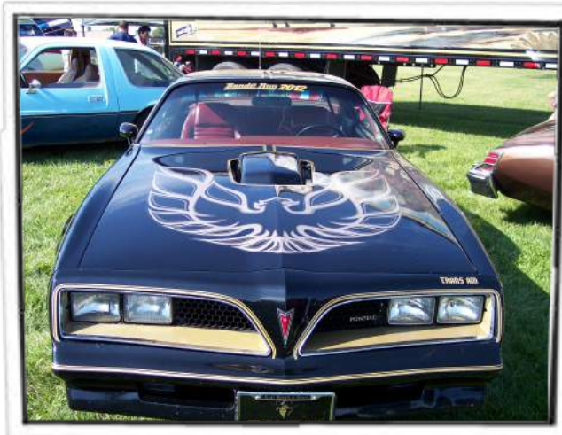
"Smokey and the Bandit"