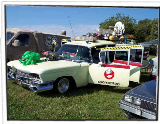
"Ghost Busters" Car