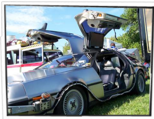
"Back to the Future"