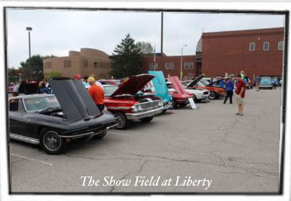
The Show Field at Liberty

The Liberty car show - held on October 15 was well attended. Over 200 cars were entered in this show. As a club we cruised together and experienced good weather and a well organized event.