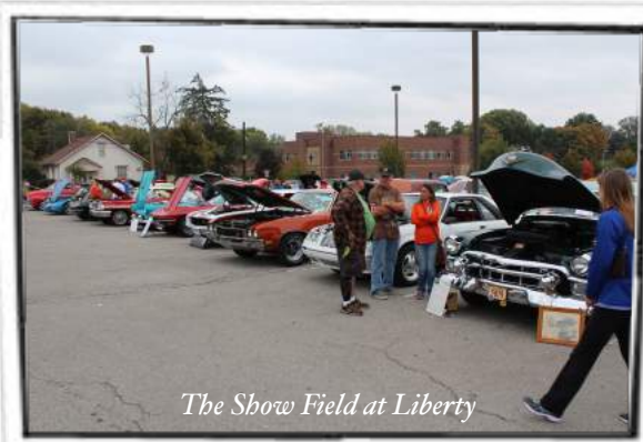
The Show Field at Liberty