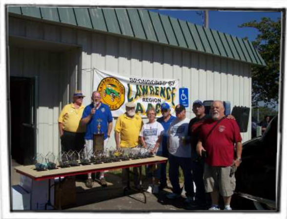
AACA - KC Members presenting "Recognition"