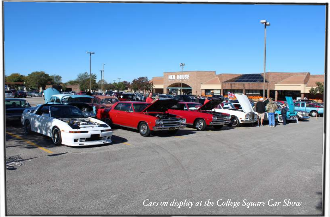
Cars on display at the College Square Car Show