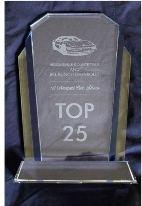
Beautiful Top 25 Trophy