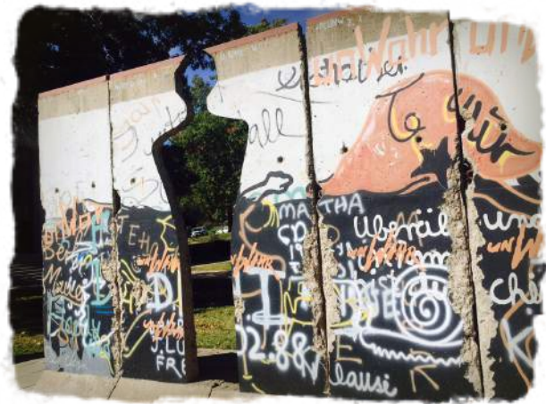
The West-facing side of the Berlin Wall relocated on the Westminster Campus.