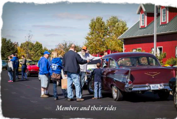
Members and their rides