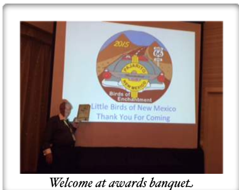
Welcome at awards banquet.

"Yes, I may be old but I'm still beautiful enough to get The Gold," we thought we heard her say as we loaded her back into the trailer.