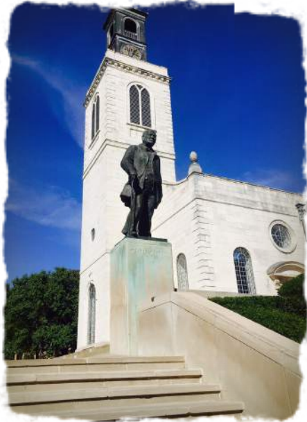
Statue of Winston Churchill

After the Warm Springs tour and lunch in Boonville with tanks and tummies replenished six caravaners,