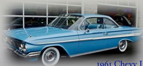
1961 Chevy Impala Bubble-top