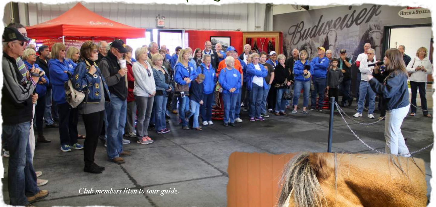
Club members listen to tour guide