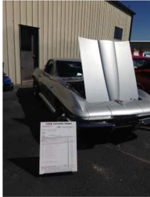
The Field's Silver Corvette