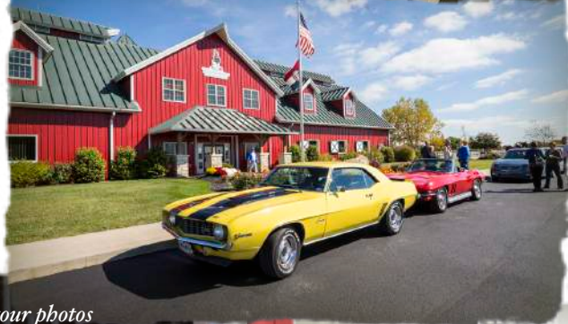
A composite of tour photos