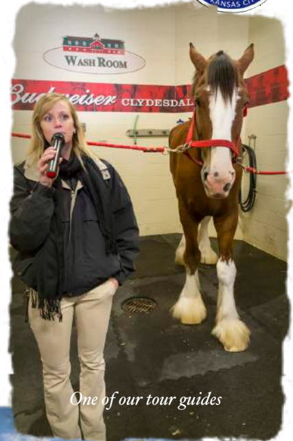
One of our tour guides