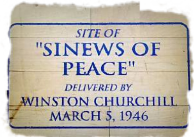
Sign on the floor where the speech was delivered