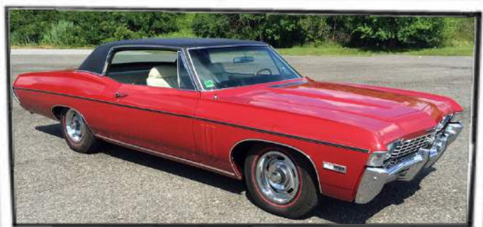
68 Right Front.

This car and the history of the SS427 can be viewed on web site www.impalass427.com