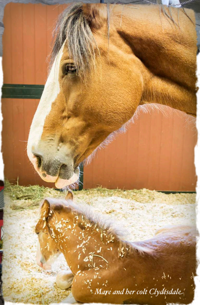
Mare and her colt Clydesdale