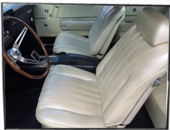
Left front interior