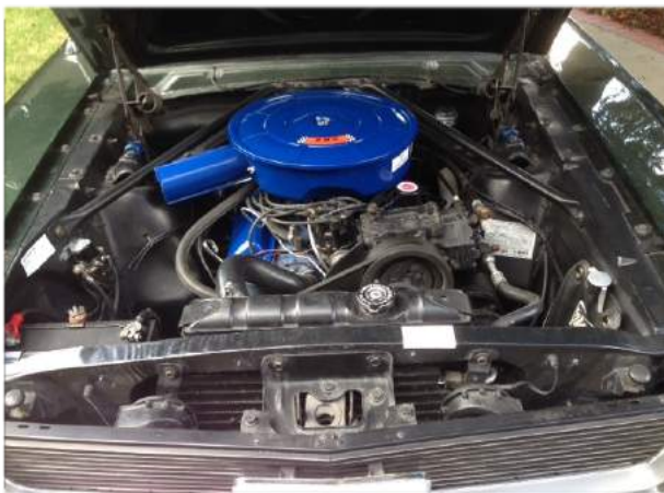
The Mustang's Engine

Mustang in tow, flying down hills and barely making over the next one.