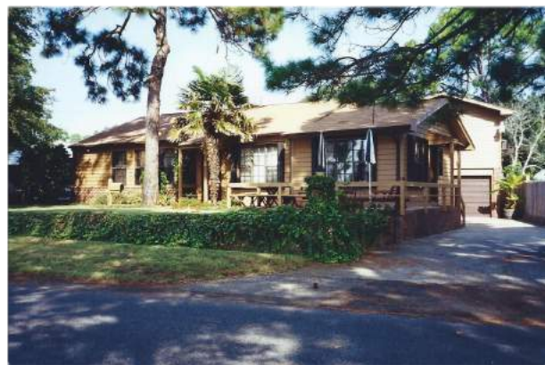
The Mustang's Pensacola, Florida Home