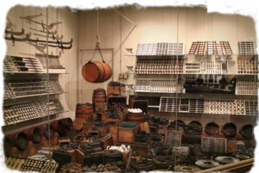
● Supplies for the Frontier