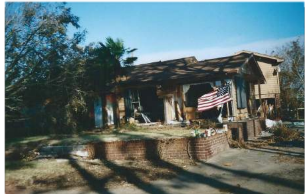
The house after Hurricane Ivan hit

However on July 7, 2000, I finally gave into that "Save Me" voice and became the