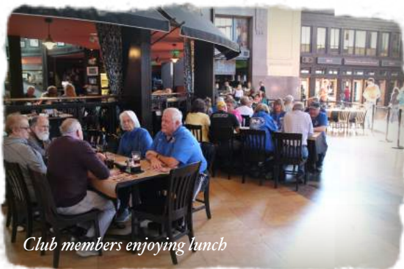
Club members enjoying lunch

members toured the museum on Saturday, February 27th to view thousands of recovered artifacts including clothes, tools, guns, dishware and more. Special thanks to Roscoe Yoder for saving parking spaces at the City Market parking lot for our members participating in the tour of Steamboat Arabia Museum. We were amazed to learn that the collection is a work in progress as