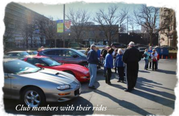
Club members with their rides