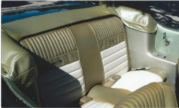
The Mustang's Back Seat

Showing our Mustang has allowed us to see and learn about other classics and their interesting owners. In 2015, we joined AACA and competed at AACA-KC Central Spring Meet in Independence, Missouri. This was a wonderful show and further helped to identify parts we needed to put this car in compliance with its factory standards. Driving our car is always an adventure whether the top is up or down, especially with that rumbling V8 engine which hates the brake pedal.