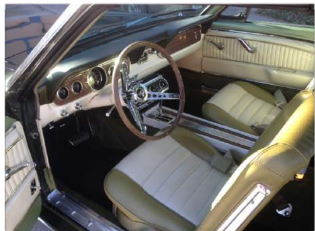
The Mustang's Interior

Mustang's 6 th owner. My husband and I towed it on a trailer with our four-wheel drive Jeep Cherokee all the way to Lee's Summit, Missouri. The Jeep performed well until we hit the hills around Columbia, Mo. I suspect there are still stories told about a Jeep, with a little green