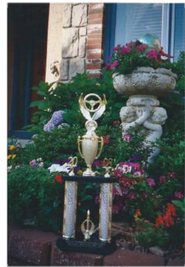
The Mustang's Awards

member advisors, who were instrumental in bringing our Mustang back to life. Through the club we met an expert mechanic for mechanical and body repairs. We did all the cleaning and for a while we didn't think we would ever get all the Pensacola sand out of it. We also discovered that mice thought our Mustang was a great home.