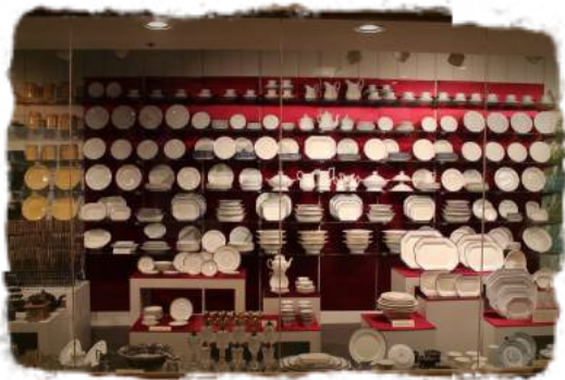
● China & Pottery Collection