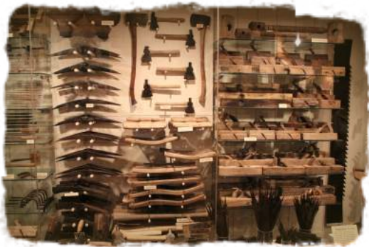
● Wooden Tools & Implements